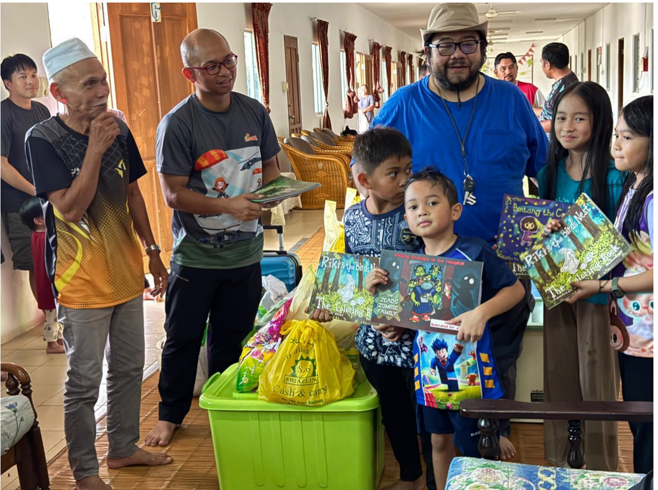
Photo: A participant presenting colouring book donations to children in the local village.