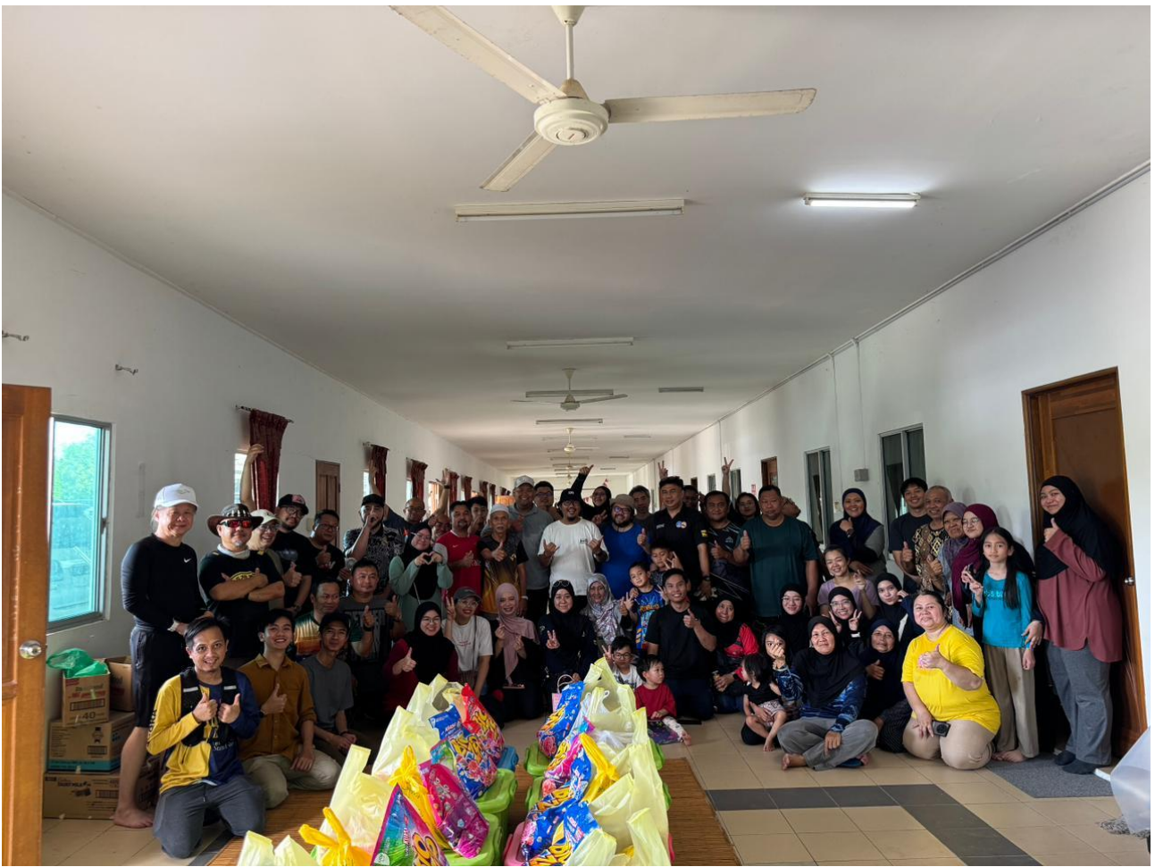
Foto: Para peserta bersama penduduk Kampung Melilas bergambar ramai sebelum memulakan perjalanan pulang.