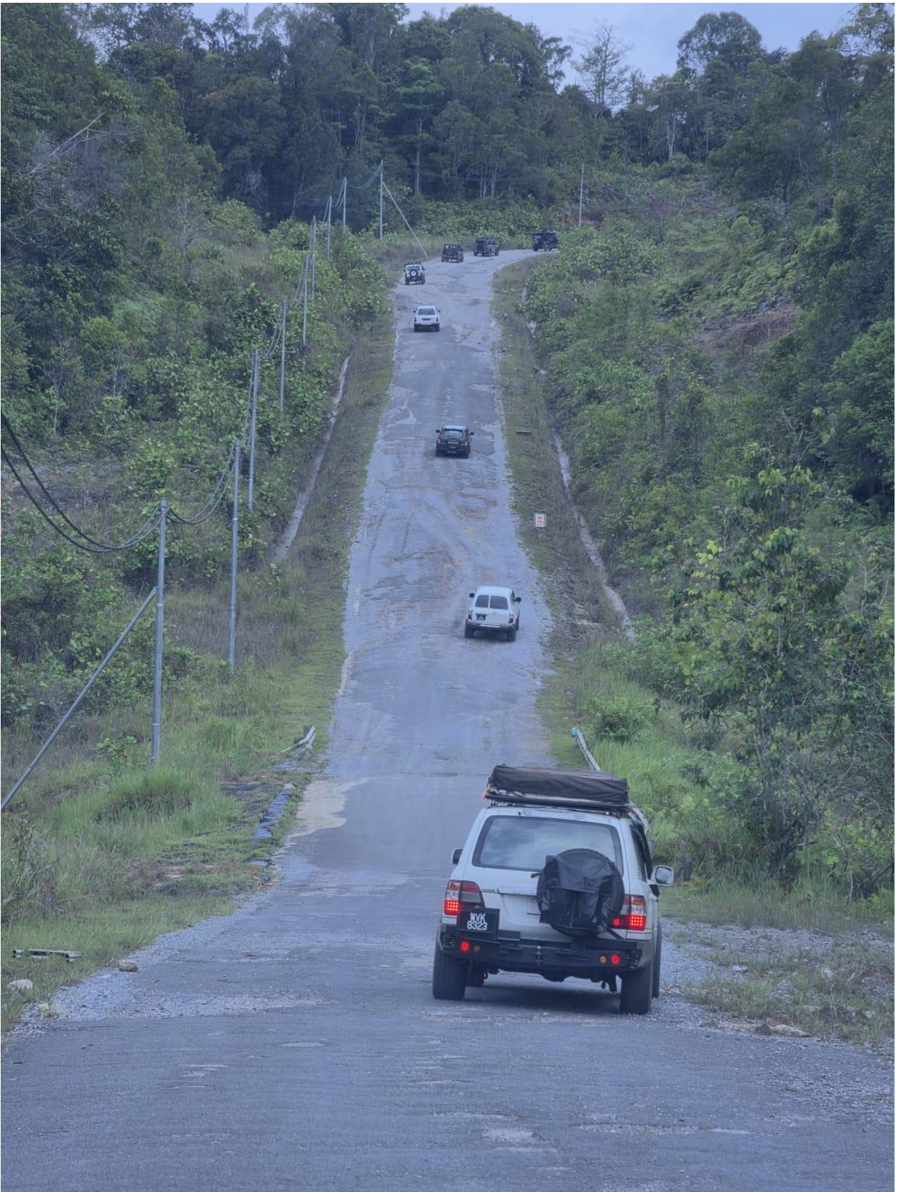
Photo: Convoy en route to Kampung Melilas, Ulu Belait.