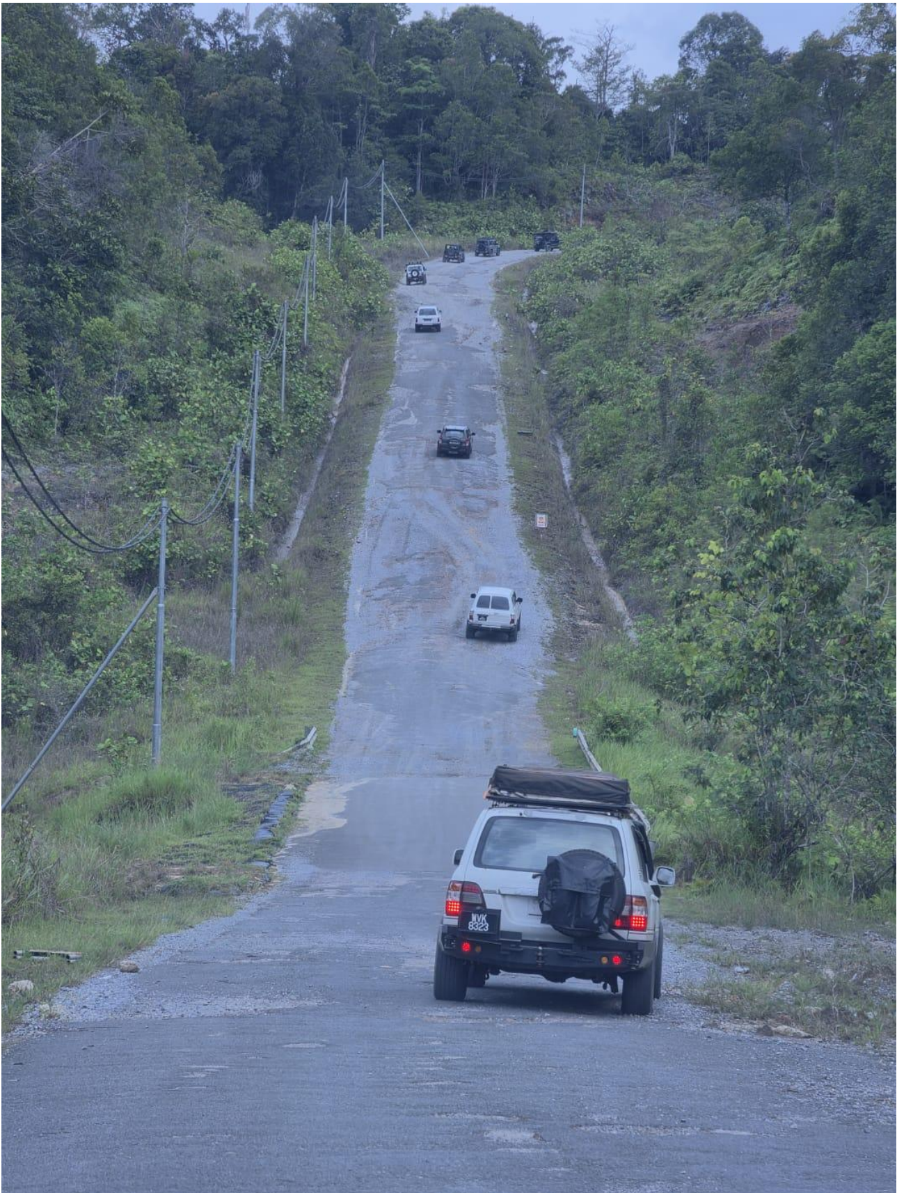
Photo: Konvoi semasa dalam perjalanan menuju ke Kampung Melilas, Ulu Belait.