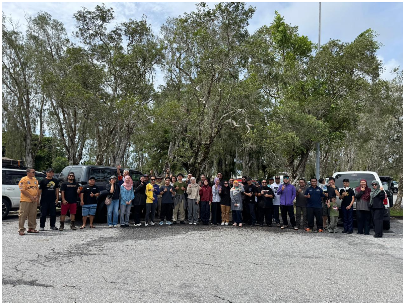
Foto: Sesi taklimat keselamatan dan sesi bergambar bersama peserta sebelum memulakan perjalanan ke Melilas.