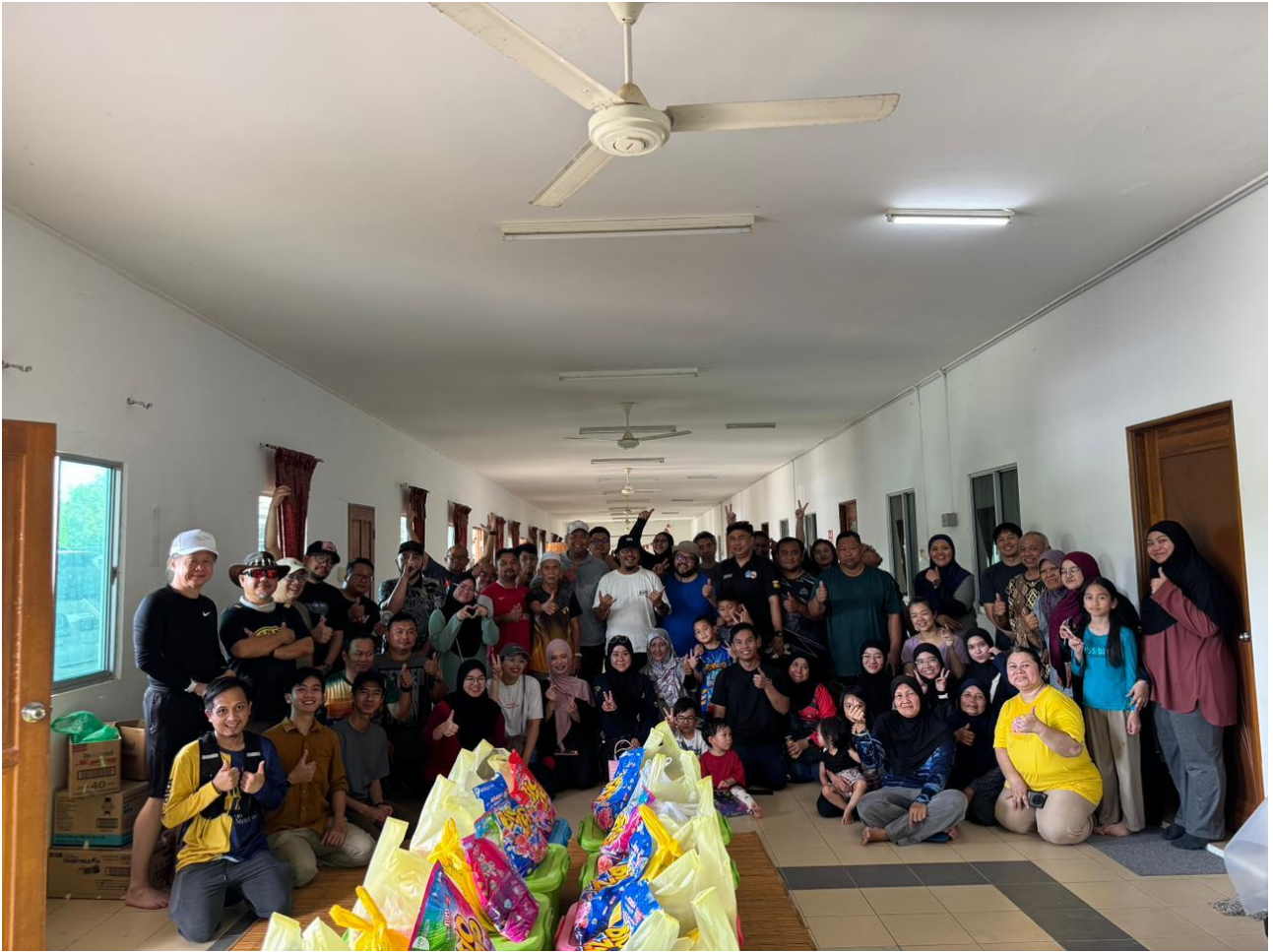
Photo: Participants alongside Melilas village hosts before the return journey.